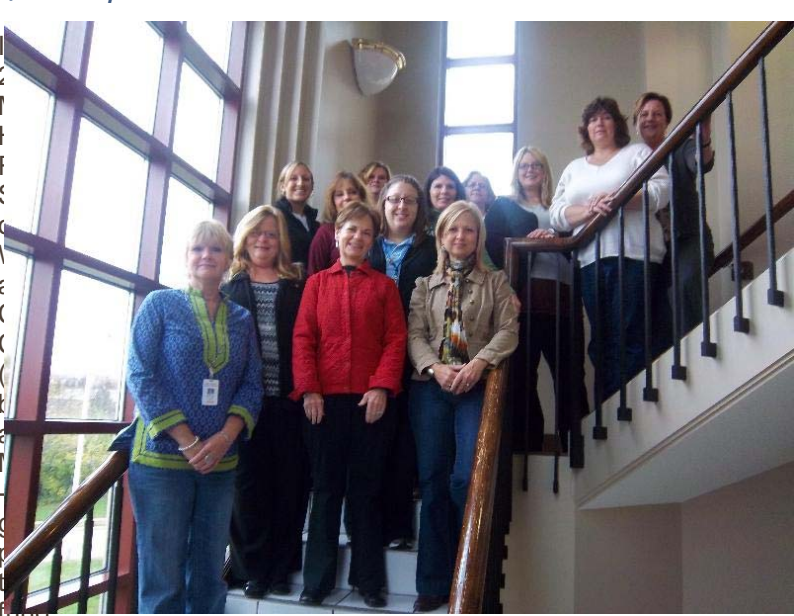
innovertheed above are representatives from the non-profits in mental health Clinton and Warren Counties receiving MHRS mini-grant funding this fiscal year.

substance abuse programs with key partners in the community, focusing primarily on prevention services. The inaugural year funded a total of 8 projects. In 2011, MHRS continued this competitive grant program and awarded an additional 14 grants.